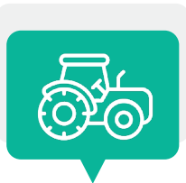
Agribusiness & Supporting Infrastructure