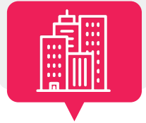
Urban & Social Infrastructure